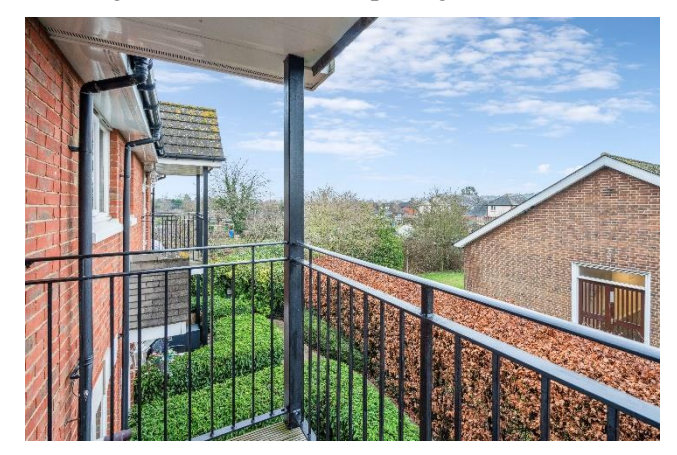
SOUTH FACING BALCONY two radiators, coved ceiling, television aerial points.

LOUNGE/DINING ROOM an excellent room with double glazed French doors opening to