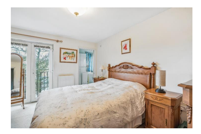
BEDROOM with double glazed French doors with fixed balustrade, radiator, built in wardrobe, television aerial point and door to:

FITTED KITCHEN with a range of maple fronted wall and base level units with single drainer stainless steel sink unit, stainless steel four ring gas hob with cooker hood over and stainless steel oven below, tiled floor, space fop fridge/freezer, radiator, tiled walls, Maxol gas fired boiler for gas central heating and domestic hot water, extractor fan, space and plumbing for washer/dryer and slimline dishwasher.